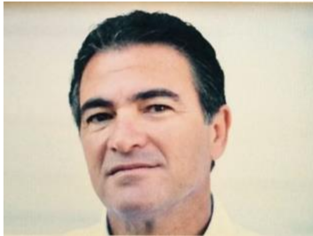
Yossi Cohen

Mossad: “An operational agency, an intelligence agency, also ‘an agency that frequently paves the way to diplomatic relations, especially with countries with which we do not have official ties...They operate with exceptional daring and great imagination, at times at personal risk. They do this in order to ensure the security of Israel in the face of terrorist threats, the Iranian threat and additional threats... Yossi...has a wealth of experience and achievements, as well as proven abilities in the various aspects of Mossad activity. He has leadership skills and a professional understanding, which are both necessary for one who is to lead the organization.’” 1)